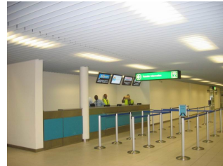
View of the Transit Information Desks after entering through Gate 1 or 2. The Immigration booths are in the opposite direction.