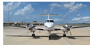
Piper Navajo Panther